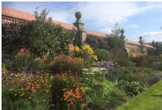
The new hot border at Eaton Hall