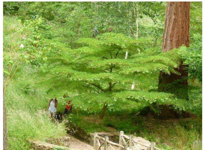
Trees in the arboretum at Gresgarth

moved in 1978 to Gresgarth Hall, Lancashire, where she found garden making a real challenge. It took her a long time to understand how to work with the English weather and light – so different from what she knew. Good gardening friends from Europe told her she'd be able to grow nothing but alders and birch trees, and she wished Russell Page were still alive to give her help. But through trial and error, and constant learning, she now grows all sorts of seemingly difficult species, and it is here that she experiments with what can be grown, and what works well together, which she can then translate into her work. It also taught her that for any new project, the sense of place and climate make a huge difference. Before any design can begin she has to take time to explore a new area and to see what works there. She finds inspiration and learns everywhere and travelling has widened that vocabulary. Villandry showed how beautiful a kitchen garden could be. From China and Japan, she learnt to look in a different way at the placement and shapes of rocks, water, and especially trees. And back at Gresgarth, digging out stone boulders, she found herself using them; one large one in particular she placed where it was hit by the evening light. So now everything has importance – shape, scent and light.