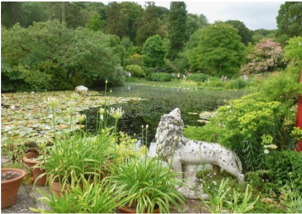
View across the lake from Gresgarth Hall