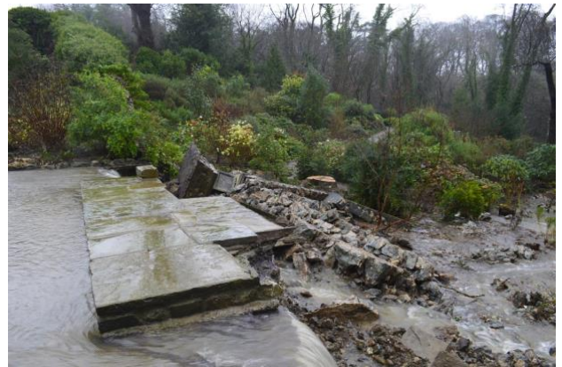
And during the Flood in December 2015

restored again and now offer a wonderful variety of interest throughout the seasons from the spring flowers, summer borders, through to autumn colours and fruits in the kitchen garden. The trees and shrubs give year round interest and red squirrels can be seen. Visitors are welcomed to the garden. There is a visitor centre and tea room and cottages are available to book for a stay.