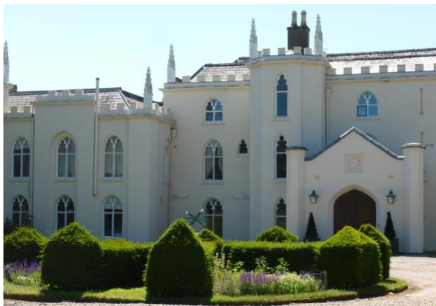
Combermere Abbey in gothic style

experience on larger estates, so he started at Upton House near Banbury in Warwickshire where he learnt a great deal. From there he went as Head Gardener to a private estate with a walled garden and old mulberry trees where he was able to redesign some of the flower beds. He stayed there for 3 or 4 years.