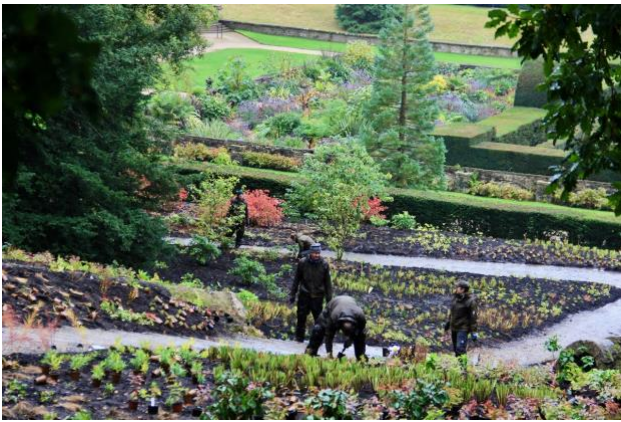
Planting in Arcadia above the Maze

Tom Stuart Smith was bought in to develop 'Arcadia' in the woodland areas above the cascade and the maze. Four open glades appeared here once the Rhododendron ponticum had been removed. Originally these areas were to be seeded, but sponsorship allowed plants (250,000 of them) to be used instead. Much of the planting was done during the pandemic, with Tom