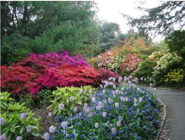
Spring 2020 in the gardens.

Walton Hall and Gardens are known in Warrington as "the jewel in the crown". They certainly offer the most variety in the town offering plenty of facilities for children and adults. There are formal gardens with azaleas and rhododendrons in the spring, bedding plants and herbaceous borders, as well as a large collection of trees, some of which must be heading towards 200 years in age. Gentle walks through the gardens and trees, and around a pond with water lilies, make for a very pleasant few hours. Then there is the recently restored conservatory range, the central part and one wing of which are open to the public. Gone are the days of large teams of gardeners but, despite this, visitors admire the relatively well-kept grounds.