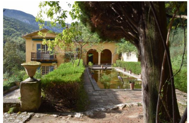
Harold Peto Garden

garden designed in the image of a ship's deck with a fairytale style French parterre at the end. The fairytale continued as her 30 gardeners dressed in naval uniforms with red pompom hats tended the nine ornamental gardens. It was not only the blue skies that attracted the English and others, but the opportunity to grow plants that would not survive in their homeland. Harold Peto purchased 19 acres in the Val de Gorbio to cultivate seeds and plants from SE Asia, Australia, South Africa, Chile, and the Himalayas. Serre de la Madone allowed Peto to develop his gardens with secret corners and gentle vistas.