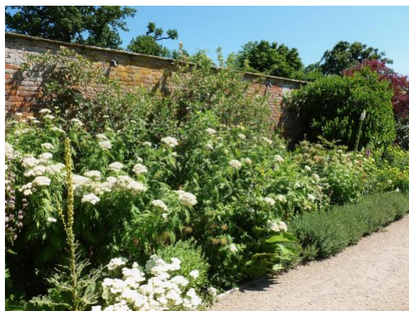
The white border in the walled garden