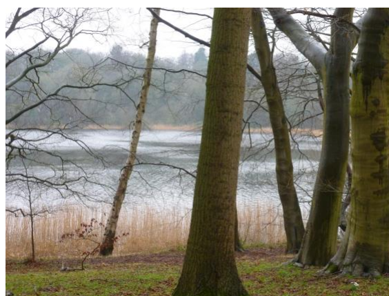
Overlooking the mere