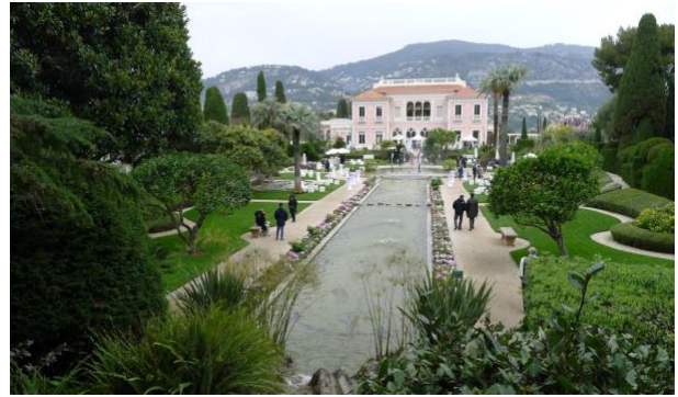
Villa Ephrussi de Rothschild

Villa Ephrussi de Rothschild is one of the most visited tourist attractions of the Cote d'Azur. A demanding baroness, Béatrice Ephrussi de Rothschild had the