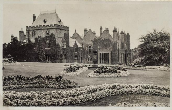
Walton Hall and gardens at the time of the Greenalls. Photo from Lady Daresbury's photo album, still in the care of the family, c1920s.

Walton Hall and Gardens are known in Warrington as "the jewel in the crown". They certainly offer the most variety in the town offering plenty of facilities for children and adults. There are formal gardens with azaleas and rhododendrons in the spring, bedding plants and herbaceous borders, as well as a large collection of trees, some of which must be heading towards 200 years in age. Gentle walks through the gardens and trees, and around a pond with water lilies, make for a very pleasant few hours. Then there is the recently restored conservatory range, the central part and one wing of which are open to the public. Gone are the days of large teams of gardeners but, despite this, visitors admire the relatively well-kept grounds.