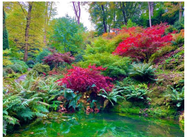
Reflecting Pool and Lower Valley

The gardens at Plas Cadnant have been a labour of love for Anthony and have been recognised as one of the 20 best gardens of Wales. They were of great interest to Prince Charles when he visited in 2017.