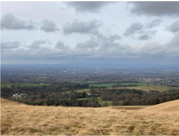
View from the moorland above Lyme Hall, looking down on the Hall to the left and the Cage to the right

This resource was damaged by extensive flooding in 2019, and the continuing threat posed by flooding and climate change necessitates action. Cheshire Gardens Trust was invited to a consultation on flood alleviation proposals. Studying reports and having the delight and excuse to walk Lyme Park again, we forwarded comments and participated in an online meeting with National Trust officers. Once they have had a chance to digest consultation with statutory consultees, including the Peak District National Park and Historic England, there is likely to be a site meeting to look at proposals