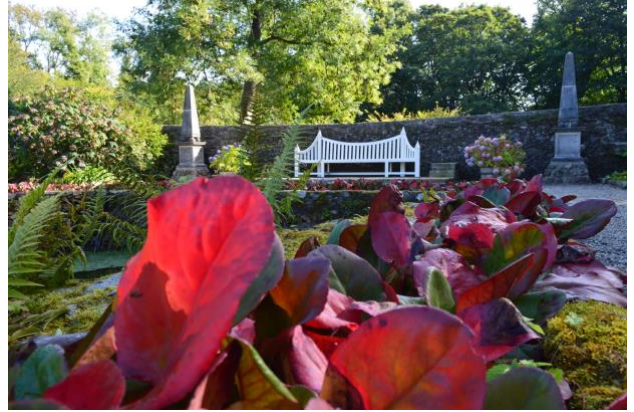
The Feature Bench Plinth before the Flood in October 2015

The gardens were devastated by floods in 2015 but were