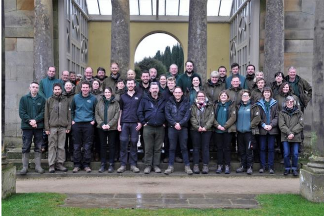
The garden and parkland team at Chatsworth