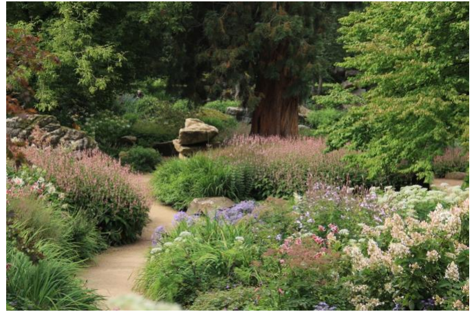
New planting in the Rock Garden

At the same time Tom Stuart Smith revitalised the Rock Garden, emphasising the massive rock formations, introducing more planting and changing the layout to make the central area more accessible.