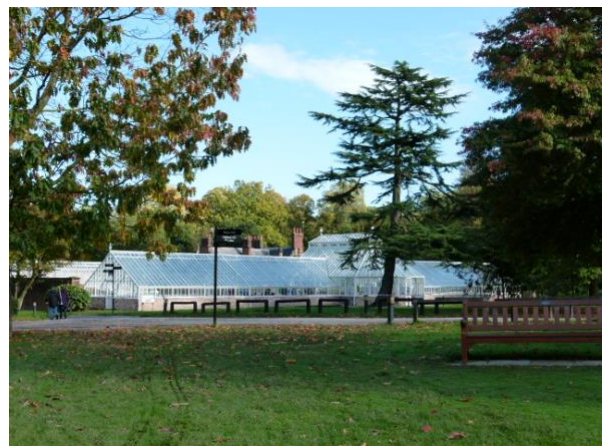
Restored conservatory range