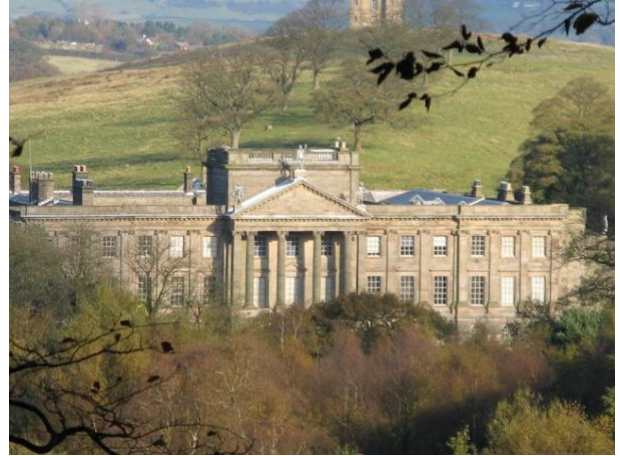
View of the hall with the Cage beyond

in more detail before a planning application is submitted.