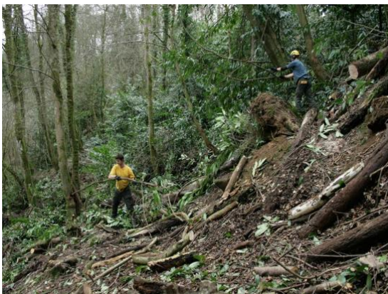
Uncovering the Valley Gardens