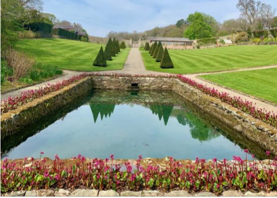
Pool and Yew Walk

The Hidden Gardens of Plas Cadnant are to be found in a steeply sided valley with a microclimate on Anglesey beside the Menai Straits.