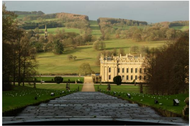
View of Chatsworth House and cascade with views to parkland beyond

In the 1730s and 40s, possibly under the direction of William Kent, the formal garden was grassed over and the kitchen garden moved further from the house. He was followed by 'Capability' Brown who moved a lot of clutter nearer to the house and developed the surrounding parkland. The entrance drive was moved to allow the iconic view of the house that we see today.