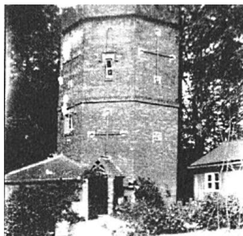
Historic picture of Round Tower at Lawton with pigeon keepers cottage, now kept at Cheshire Archives

Lawton Hall became a school and has now been converted to apartments, but the public can still enjoy these views and relics of the designed landscape from the footpath.